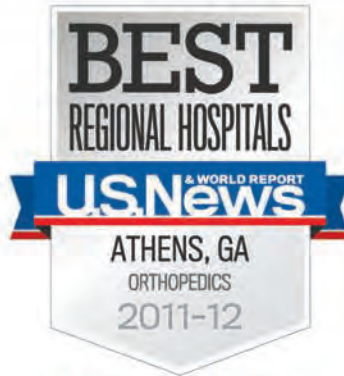
U.S. News & World Report BEST REGIONAL HOSPITALS 2011-2012 Orthopedics