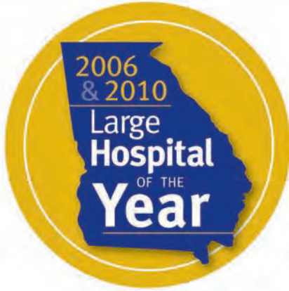
Georgia Alliance of Community Hospitals