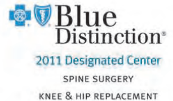
2011 Designated Center SPINE SURGERY KNEE & HIP REPLACEMENT