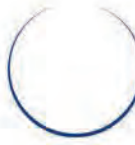
CIRCLE of LIFE® 2011 Citation of Honor HOSPICE & PALLIATIVE CARE