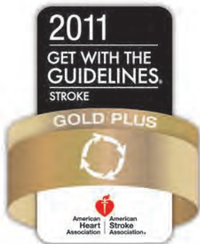
Gold Plus Performance Award STROKE CARE since 2010