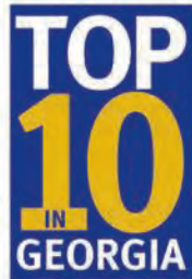
2012 Georgia Trend Magazine